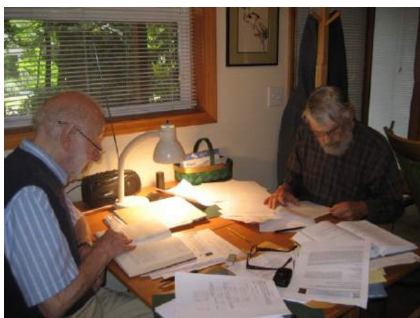
Ingram and Al at work in Seattle, August 2015

And so began their legendary, 58-year collaboration. First and foremost must be noted their landmark treatise on majorization [4], in which they show how many, if not most, classical inequalities, such as the arithmetic mean/geometric-mean inequality, Hadamard’s inequality for the determinant of a positive definite matrix, isoperimetric inequalities for convex polygons, and entropy inequalities, all arise in the unified framework of majorization. Their statistical applications of majorization included the unbiasedness and power monotonicity of multivariate hypothesis tests, concentration inequalities for sums of independent random variables, and bounds for the probability of correct selection of the largest cell probability in a multinomial distribution or the largest population mean based on a sample from independent univariate distributions. We estimate that over three thousand papers citing the first and second editions of [4] have subsequently appeared.